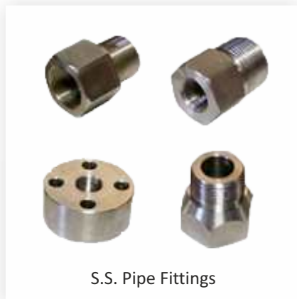
S.S. Pipe Fittings