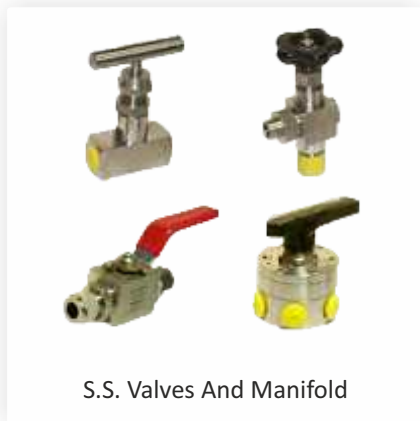
S.S. Valves And Manifold