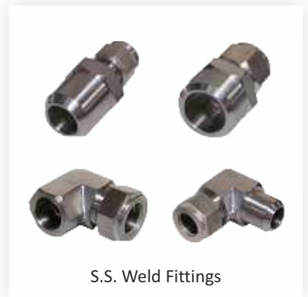
S.S. Weld Fittings