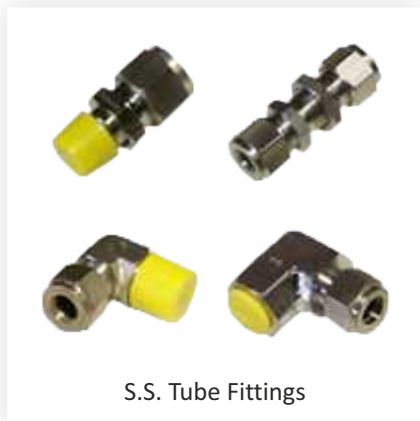
S.S. Tube Fittings